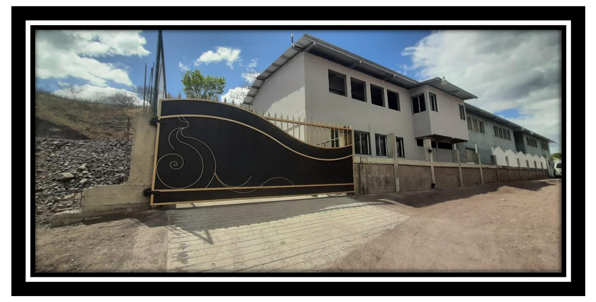
Want more frequent updates, pictures and videos? Check out the schools Facebook page at https://www.facebook.com/AcademiaCristianaPalacaguina/

Dios te bendiga de la familia Witonski!!! (God Bless you from the Witonski family)